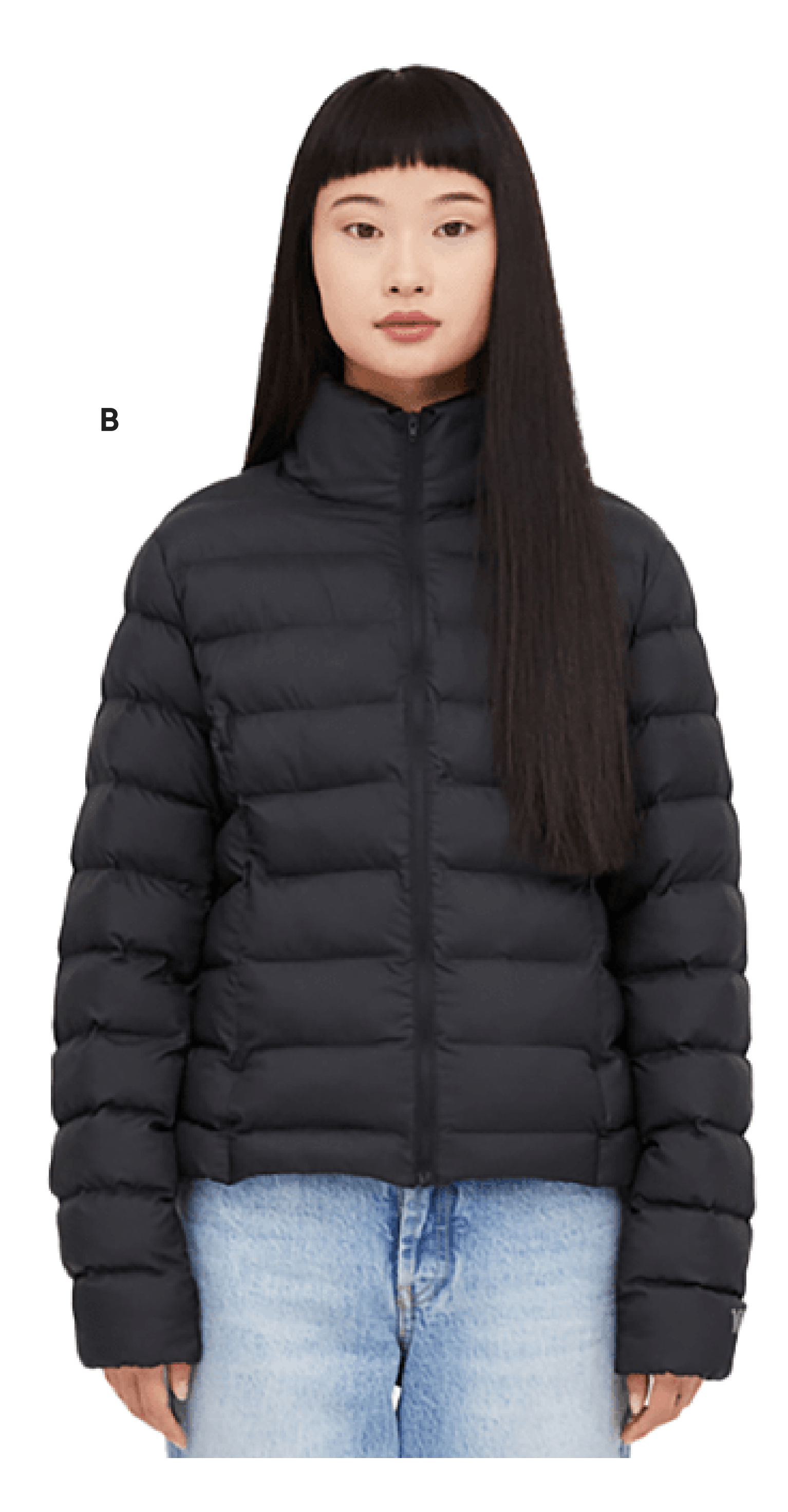
B: tentree | Cloud Shell Packable Puffer | Women's

The tentree Cloud Shell Packable Puffer is a warm, planet-friendly puffer jacket that uses eco-friendly technology. It's rated to withstand temperatures down to 0 °C. In addition to the separate drawstring pouch that allows the jacket to be easily packed away, the jacket includes zippered hand pockets, spacious interior pockets, and a hanger loop at the back neck. Plus, every tentree purchase plants 10 trees, and with a trackable tree code on each hangtag, you can see the good you're doing in real time! And through a partnership with 1% For The Planet, one percent of sales are donated to environmental nonprofits.